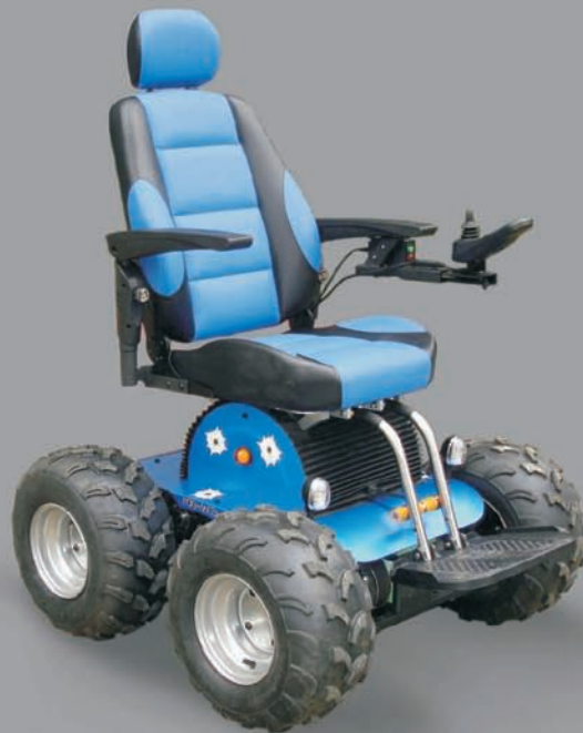
OB-EW-002 OFF ROAD