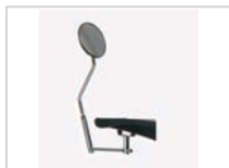
REAR VIEW MIRROR